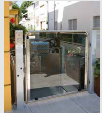
Stainless steel version (on option)