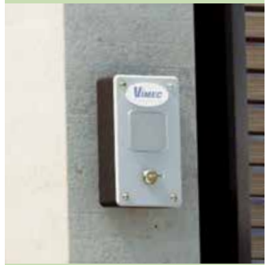
Floor control panel 50X50 mm - Silver