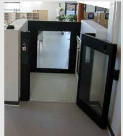
Steppy with automatic doors and gates