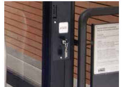
Floor control panel Steppy