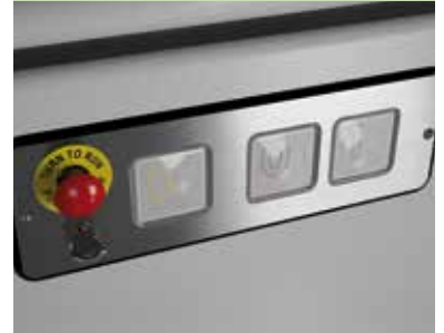
On-board control panel Silver