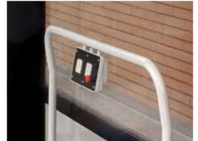
On-board control panel Steppy

the Steppy platform lift's technical and stylish features, make it a favourite among the best Italian installation engineers with hydraulic mechanics, metal or grey polycarbonate enclosure, to improve the design and the aesthetics of the lift. Vimec has designed a control on board and a landing radio control which makes the Steppy the functional leader in the market place.